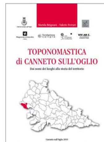
3 - M. Brignani, V. Ferrari, Toponomastica di Canneto sull'Oglio , cover of the catalog

For only the citizens, who are aware of the value of what they possess, are motivated to promote and safeguard it.