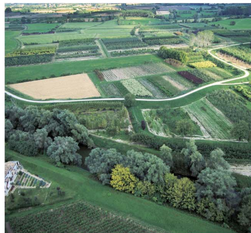
4 - The landscape of the nurseries between Oglio and Chiese rivers, Bizzolano (Canneto sull'Oglio - Mn).