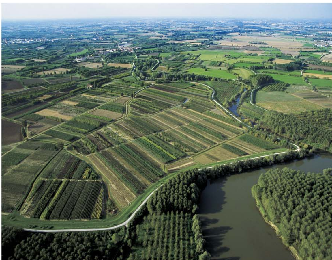
1 - The architecture of the territory. The land fragmentation and the web of waters and roads, Canneto sull'Oglio (Mn).