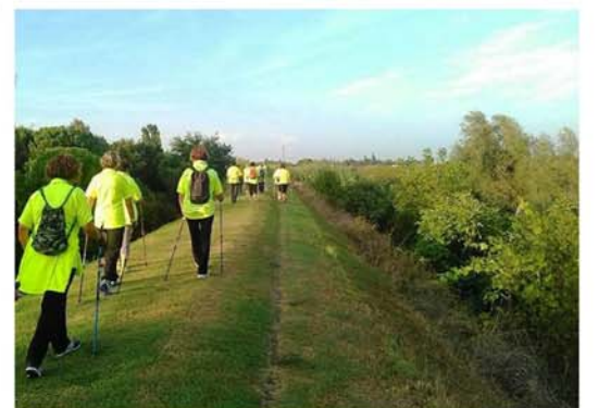
The cycle path on the top embankment of the Lamone river.