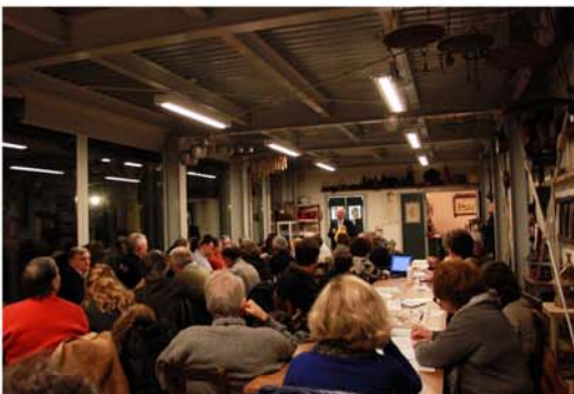
A Negotiating Table about the project.

Manifesto of the Lamone's lands in which promoters expose the motivations for activating River contract: an agreement that brings active communities, benefiting from the presence of the River, to create and share opportunities and experiences, to adopt a system of rules based on public policy, by means of which the whole community takes care of the river and the land, to prevent hydraulic risks, to strengthen ecological network, to preserve biodiversity heritage, to trigger devices aiming to elevate the local tourist and economic offer as well.