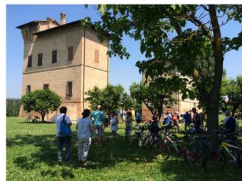
Some moments of the event Pedalèda cun la magnèda longa : a pedaling with a cultural and gastro-nomic path along the Lamone River.