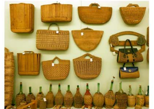
Some handiworks from the Museum's collection.