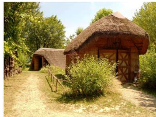
Etnoparco "Villanova delle capanne" ("Villanova of the huts"): it is an outdoor exhibition section, in which the main types of rural and marshlands buildings made of reeds have been reconstructed, which once widespread both at Villanova and in the entire Ravenna territory.