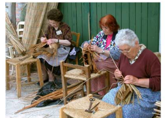
Workshop "Cantiere Aperto" ("Work in Progress"): some volunteers make weaving demonstration of marsh plants.