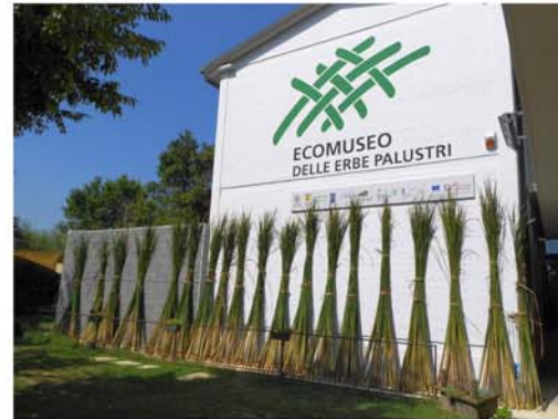
The new headquarters of the Marsh Plants Ecomuseum, opened in may 2013.

The Marsh Plants Ecomuseum is a cultural institution of the City of Bagnacavallo. The management is entrusted, by convention, to the "Civiltà delle Erbe Palustri" cultural association, which has developed the collections and promoted the educational and museum activities since 1985. The Ecomuseum was created thanks to the participation of the community of Villanova di Bagnacavallo, whose active contribution made it possible to rediscover and return to the people, a unique material and immaterial heritage relating to the processing and weaving of marsh grasses. The Ecomuseum so represents a sustainable and responsible model, made of knowledge and values to be preserved and handed down.